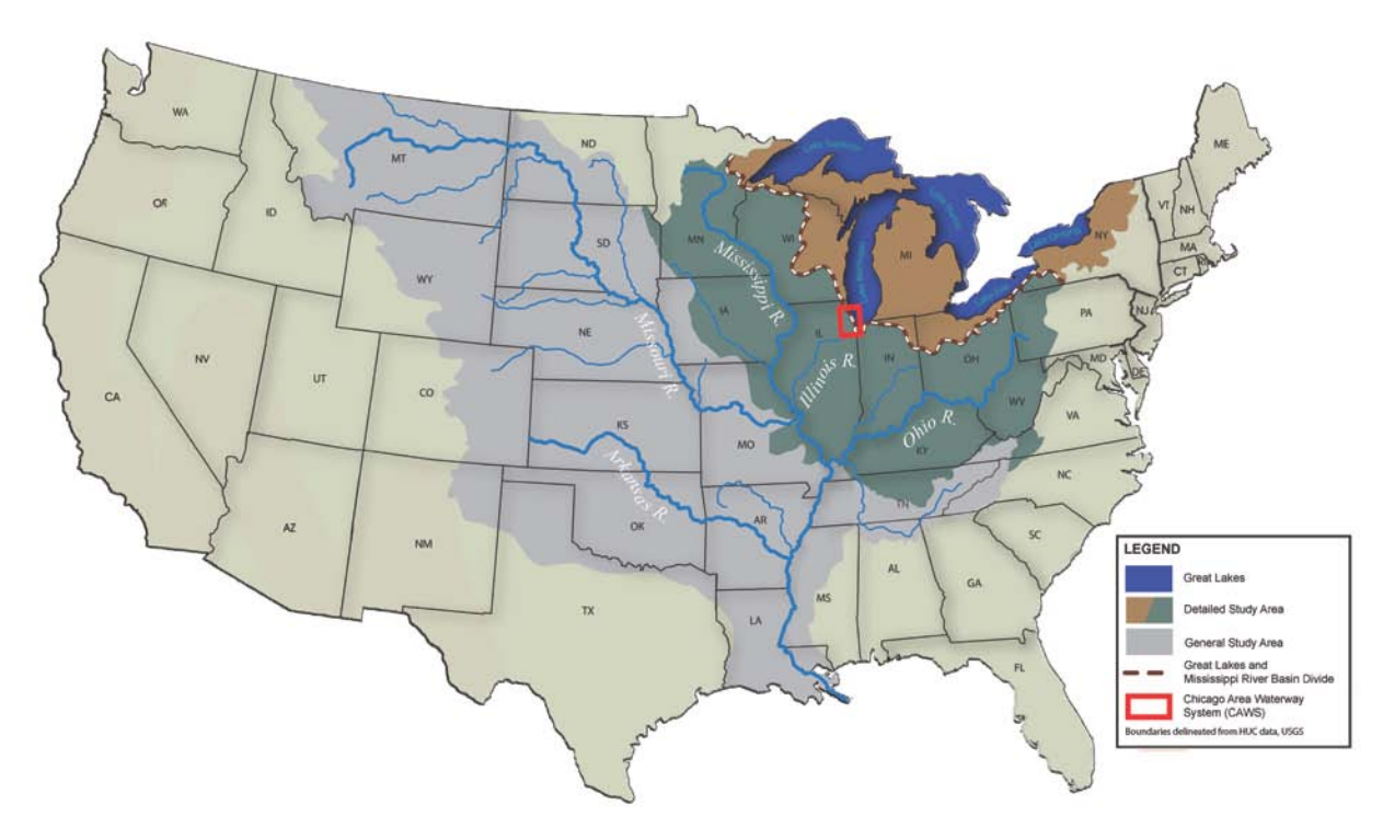
Figure 1: GLMRIS Study Area

Focus Area II covers the remaining portion of the study area along the basin divide between the GL and MR basins, within the United States. The GLMRIS Other Aquatic Pathways Team (Focus Area II Team) has identified potential aquatic pathways along this watershed boundary and is conducting a detailed characterization of these potential pathways.